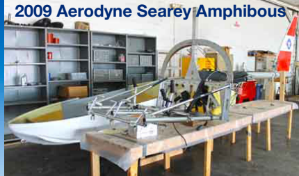
2009 Aerodyne Searey Amphibious

2009 Aerodyne Searey Amphibious Project plane has brand new factory hull, turtle deck, updated reinforced fiberglass C hull- Progressive Aerodyne. Late model structure reinforcements. Will need new avionics.