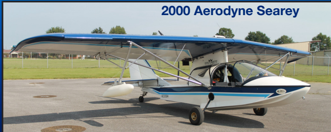
2000 Aerodyne Searey

2000 Aerodyne Searey Amphibious N2359H Aircraft S/N 1DK135 Rotax engine 914 with turbo; S/N 44017588; TTSN 1,060, 115 hp C hull fiberglass body; three blade Warp Drive prop Avionics: Garmin 250 XL, NARCO AT 150 transponder