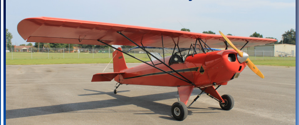
1974 Corben Baby Ace Model "D"

1974 Corben Baby Ace Model "D" N60CA-S/N Aircraft-100VA AFTT 627 hrs. Continental A65-8 S/N 5222468 TTSMOH 627 hrs. Prop: Sensenich wood prop WCK7242 Recovered w/Certified Ceconite Avionics: Garmin 510