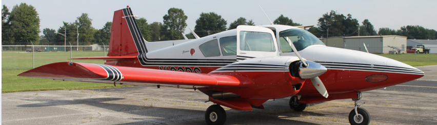
1957 Piper Apache, Geronimo Conversion

1957 Piper Apache, Geronimo Conversion N103RS-S/N 23-1165 Airframe T.T. 6400 hours L/E: Lycoming, O/H-5/99; TSMOH-560 hrs. R/E: Lycoming, new install 4/81; TSN-2510 hrs. Lycoming Engine 0-360 A1D 180 HP L/P O.H. 12/2005 TSO-231 hrs. R/P O.H. 12/2005 TSO-226 hrs. Avionics: Collins Slimline radio package, IFR Full Geronimo Conversion by Seguin Featured in Vintage Airplane Magazine 3/2003