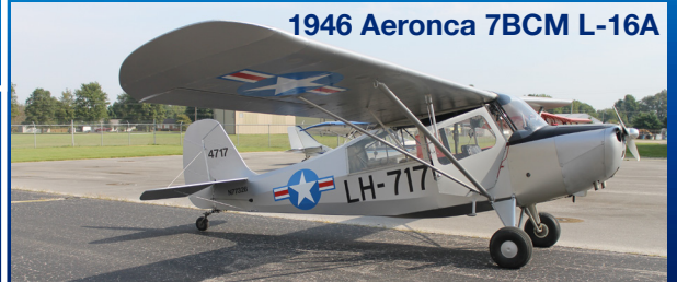
1946 Aeronca 7BCM L-16A

1946 Aeronca 7BCM L-16A N7732B- S/N 47-1168 AFTT 3,638 hrs. Continental Motors engine C85-8-FJ series; 85HP; S/N 30205-7-8 TSMOH 312 hrs. Documented military history