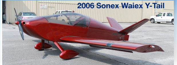
2006 Sonex Waix Y-Tail

2006 Sonex Waix Y-Tail N612BW SN 24 AFTT 225 hrs. Aero-Vee engine 80HP; Version 2.1; S/N 0599, TTSN 15 hrs.; Exceptional avionics Custom paint w/ ghost flames & smoke package Featured in Sport Aviation Magazine 10/2006