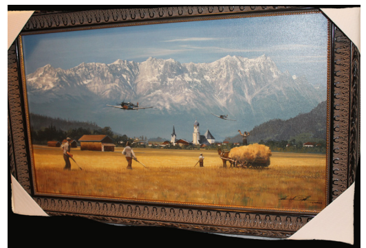
Low Pass for the Home Folks by William S. Phillips 120/2007

TERMS: Cash, check (with bank letter of credit addressed to Kurtz Auction & Realty) or credit card authorization for $5000.00 hold with wire transfer within 24 hours. Photo ID required to bid. Online bidding terms are posted at kurtzauction. com. All online and absentee pur- chases will be charged a 6% buyers premium. No buyers premium for on site purchases.