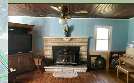
Historic Home on Tract 6