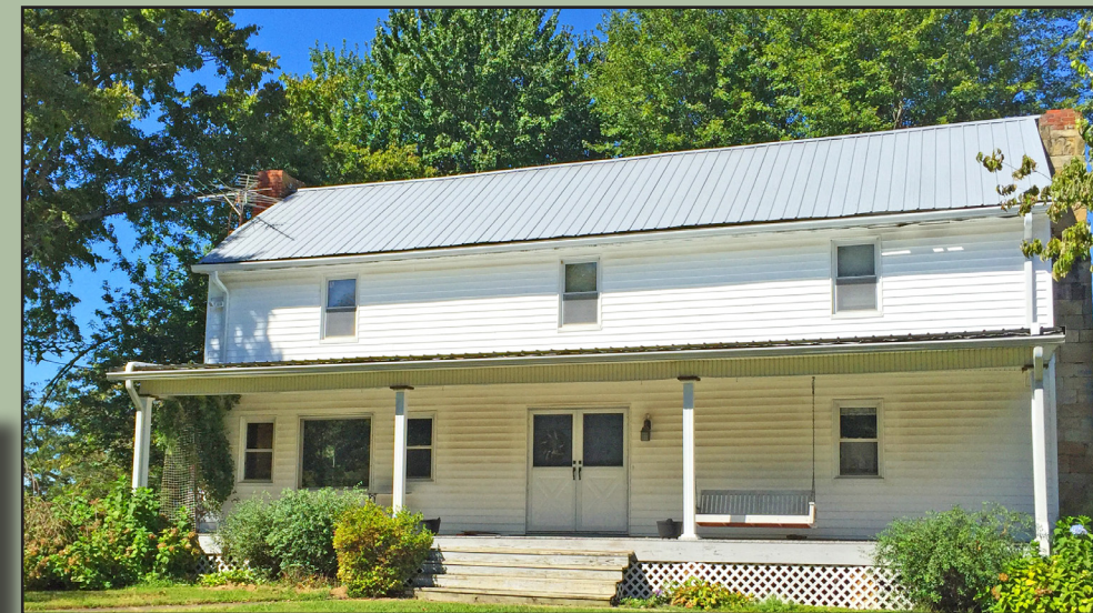
Historic Home on Tract 6