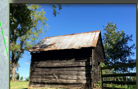
Outbuilding on Tract 6