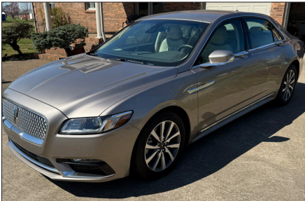
2020 Lincoln Continental w/5,335 mi.

Antique cherry Tom Blue bedroom suits, drop leaf tables, plant stands, server, curio cabinet, china cabinet, dining table and chairs; marble top center table; cherry game table; hand made marble top walnut coffee table (brought from Germany by boat ); occasional tables; sewing machine; Grandfather clock; rockers; sofa; Hitchcock style rocker; Empoli glass vase bottle; area rugs; “Gardenia” Syracuse china pattern; stoneware crocks; Direct Action gas stove; blanket chests; Sun three wheel bicycle; Pyrex; American Block; costume jewelry; 10k and 14k jewelry; Sterling silver flatware “Chantilly”; misc. kitchenware; tools; and much more.