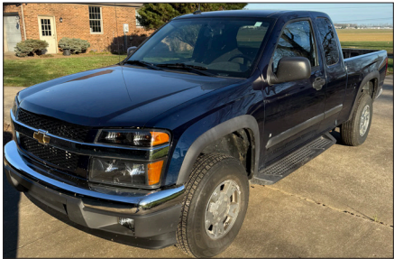
2008 Chevy Colorado w/29,260 mi.