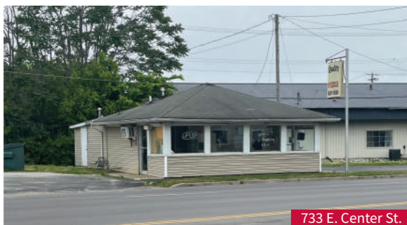
733 E. Center St.

Currently operated as Quality Pizza and being sold as an operating business Improvement include a retail area, kitchen, stock room, office, food prep area and 2 restrooms. Fixtures include deep freezes, refrigerators, prep table, pizza oven and chairs Zoned Neighborhood Commercial (NC)