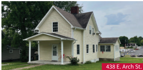
438 E. Arch St.

Three bedroom, two bathrooms Living room, dining room, kitchen and utility room