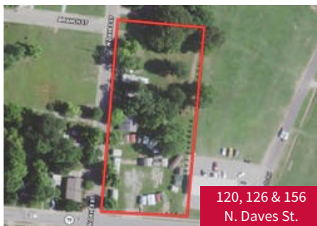
120, 126 & 156 N. Daves St.

1.646 Acres - Vacant Lot Zoned General Commercial (GC) and Multi Density Residential (MDR) Parking area and home in poor condition