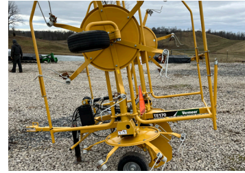
2015 Vermeer TE170 4 Basket Tedder Hydraulic fold & Raise 540 PTO VIN#- 1VR3081E8GE012061