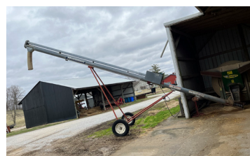
Hutchinson 8' Auger