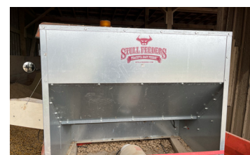
Stull Feeders Battery Powered Feeder w/Auger Holds 500 lbs. of feed