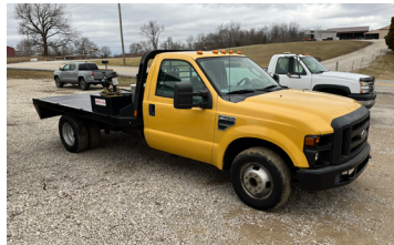
2008 Ford F-350 XL Single Cab Utility Truck 150,741+ miles 11' CM flatbed installed last year 5.4L gas engine , 6 speed trans. Tool box and fuel tank included Manual windows and locks Venal seats Vin# 1FDWF36518ED22623