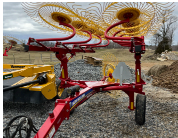
2020 New Holland ProCart 819 8 wheel V Rake w/ Kicker wheel Only 30 acres worth of use PIN #- YLZSG0439