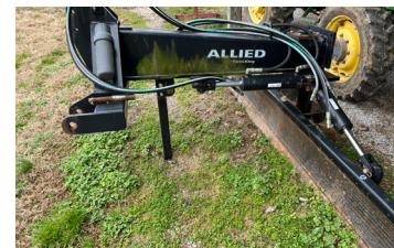
Allied by Farm King 150108 10' Box Blade Full range motion, Hydraulic