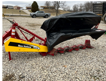
New Holland 616 8' cut Disk mower 540 PTO PIN #- Y7B140610