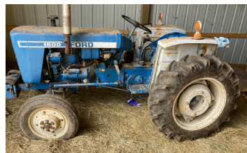
Ford 1600 Tractor 850 hrs. 540 PTO Serial #- U107926