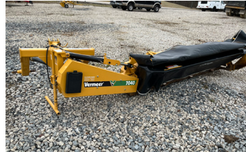
2015 Vermeer M7040 Disk Mower 9' cut 540 PTO Lightly used Serial #- 1VR3070YXA3002074