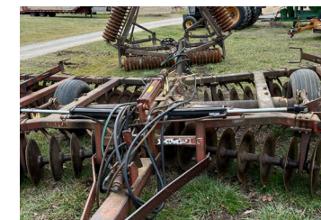
21 Ft. Krause Disk w/ 24 ft. Roller Hydraulic fold and raise