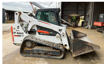
2015 Bobcat t650 Compact Skid Steer on Tracks - Diesel 2 speed, 74 HP, 1140+ hours Extra large bucket PIN #- ALJG16236