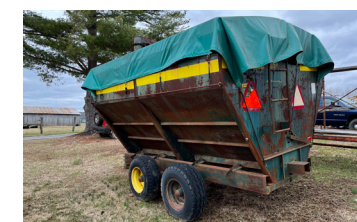
Grain-O-Vator grain cart 6 ton capacity , New tires Serial #- 12973