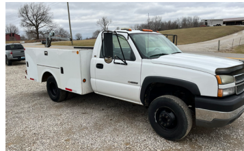
2005 Chevy 3500 Single Cab Utility Truck 244,250+ miles 6.0L Gas Engine Allison automatic transmission 9' utility bed Cloth interior w/ manual windows & locks Vin# 1BJC34U35E319417