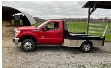
2013 Ford F-350 XLT Super Duty 1 Ton Single Cab 83,925+ miles 6.7L Diesel Engine, Dual rear wheel 9' Hillsboro flatbed installed less than a year ago Power windows and locks Vin # 1FDRF3HT4CEB06203