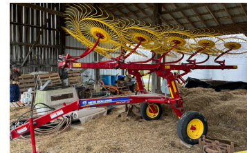
2020 New Holland Procart 1022 V Rake 10 wheel, High clearance, ground driven No kicker wheel Hydraulic fold and raise Lightly used PIN# YLZSG0089