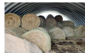
50+/- 5X6 Round Bails of Hay W/ netting stored inside