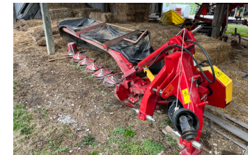
2020 New Holland DuraDisc 109M 9' Disk Mower 2 bladed Tarp in good condition PTO & Hydraulic PIN# HBJDD109PLN150088