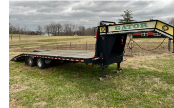
2012 GatorMade Gooseneck Trailer 20' w/ 5' Ramps Duel tandem 16,500 GVW VIN #- 4Z1GF2521DS001393