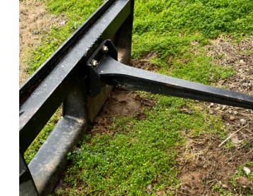
John Deere Hay Spear