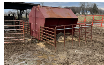
3 ton Self Feeder w/Creepers