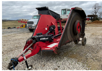
Bushhog 2715 Legend 15' cut w/ stump jumpers 540 PTO Heavy duty gear boxes Lightly used Serial #- 12-04373