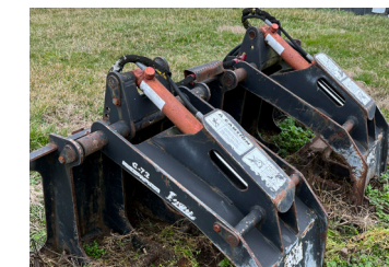
Lowe G-72 Grapple Bucket Attachment Serial # - 2-1000331