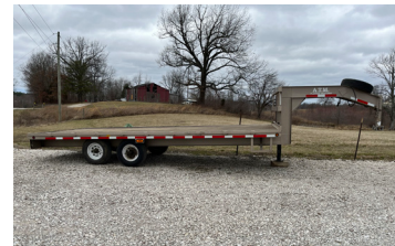
2003 A.T.M Flatbed Trailer 8.5 x 20 FT. 6,000 lbs. Axle & 12,000 GVW Pull out ramps Lights & breaks Will have to apply for title vin# 1FDWF36818ED22623