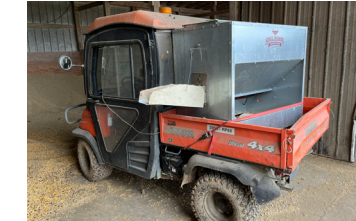
Kubota RTV900 4X4 Diesel 1,372+ hrs Power steering Enclosed cab