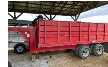
1993 WIL-RO Grain/Dump Gooseneck Trailer Duel tandem Battery powered Hydraulic lift 18,000 Lbs. GVWB 9,000 LBS. GAWR VIN: 1W9G162G2P1012322