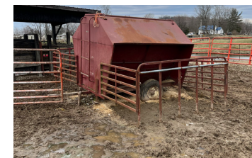
3 ton Self Feeder No creepers