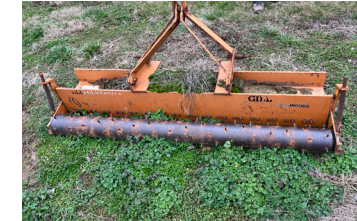
Woods 6' Gill Pulverizer