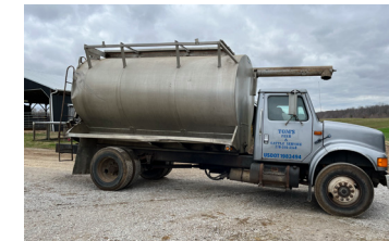
1991 International 4900 Feed Truck Engine replaced in 2012 613,000+ miles (odometer was not turned back when engine replaced) Warren feed Bed Holds 10 tons of feed Drives fine Vin# -1HTSDNSP8MH372152