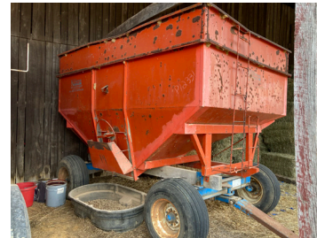
Killbros Gravity Flow wagon 350' grain body