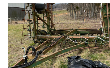
24' Field Cultivator