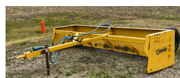
Cammond 12' Box Blade 2 brand new tires Lightly used Model #- DS12FL Serial # -09067918