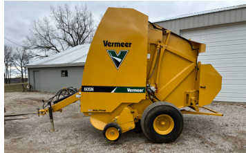
2015 Vermeer 605N Hay Bailer String or net wrap Never used 540 PTO Monitor and electronics VIN #- 1VRM16149G1003129