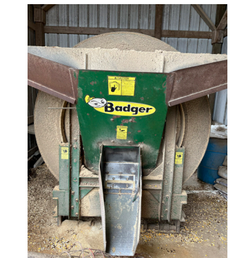
Badger BN5100 Feed Mixer No grinder Electric driven 3,000 lbs. Capacity