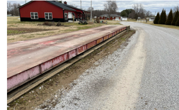
70 X10 Rice Lake Survivor Scale Weight monitor and printer Removal at buyers expense!!