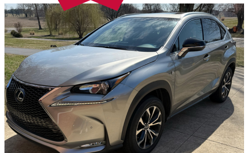
2016 Lexus N/X 200T. SUV 29,404 Miles