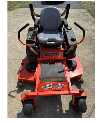
BadBoy 54" Zero Turn mower with 606.5 hours