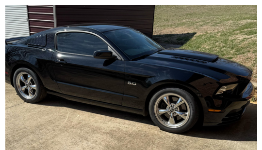
2013 Ford Fast Back Mustang GT, 5.0L engine, 35,971 miles