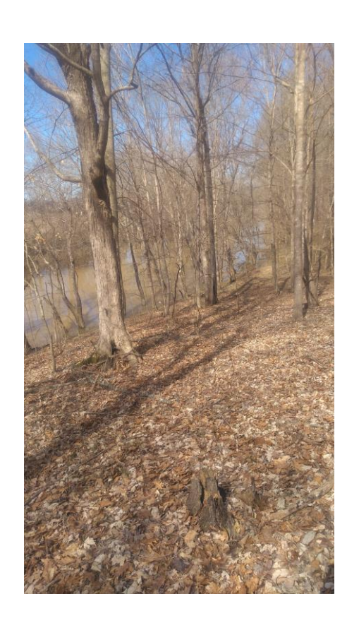
Old railroad bed.