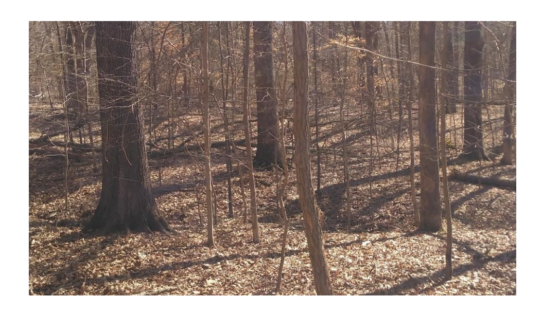
Outstanding timber dominated by various oaks.