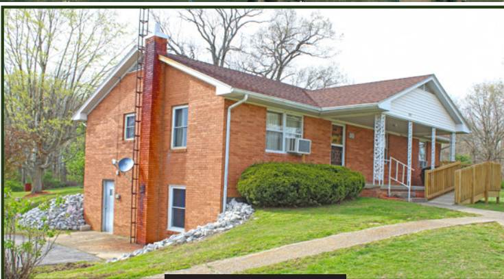
Home on Tract 1