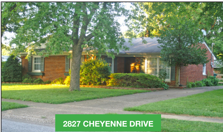
2827 CHEYENNE DRIVE