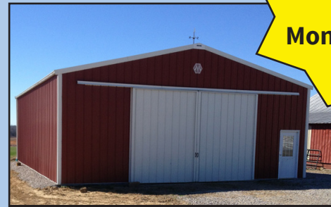
Morton Building on Tract #3

This newly remodeled home has a master bedroom with master bath with water jet tub, shower, double vanity and walk-in closet. The second bedroom has its own private full bath. The kitchen has built-in range-top, oven, microwave and dishwasher. Other space includes a dining room, family room, laundry hookups and partial basement. The home has metal siding, bottle gas heat, central air conditioning, replacement windows, newer furnace and hot water heater and a beautiful view from its hilltop perch.