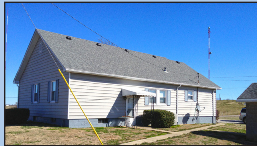
Back of Home on Tract #3

Tract #3 – 17.580 acres ± of hill pastureland with home, farm buildings and 1,264.94 ft. of frontage on the south side of HWY 416.