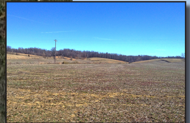
Gently Rolling Cropland on Tract #1

Tract #5 – 20.834 acres ± of gently rolling pastureland with pond, barn and 40.84 ft. of frontage on HWY 416.