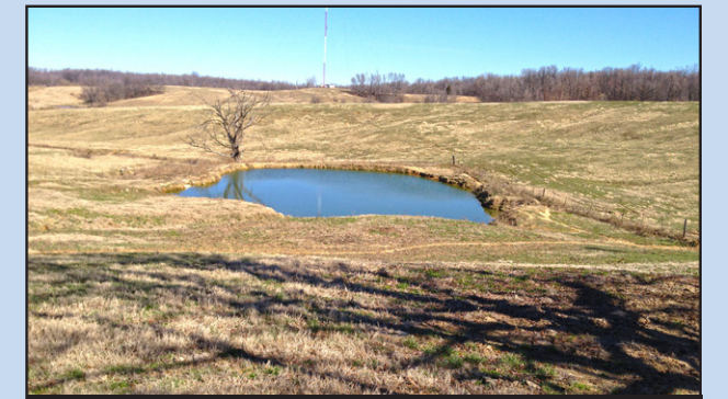
Lake on Tract #2