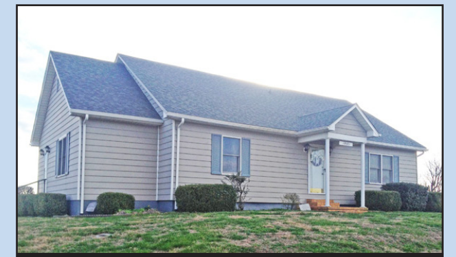
Remodeled home on Tract #3

2017 Announcements made day of sale take precedence over printed material.