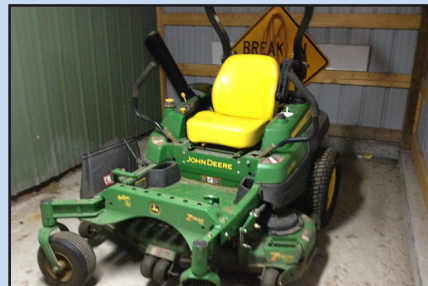
JD Z925A Zero Turn Mower