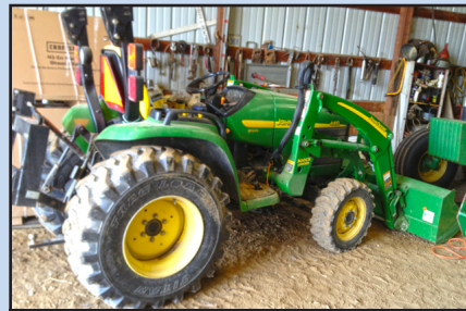
JD 4410 and 300 CX Loader

270-827-4344 800-264-1204 kurtzauction.com