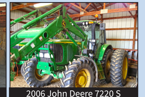
2006 John Deere 7220 S