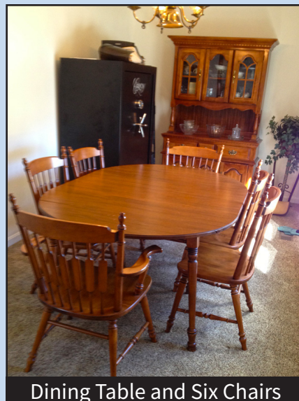
Dining Table and Six Chairs