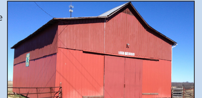
Barn on Tract #2