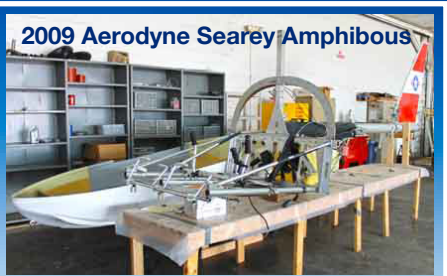
2009 Aerodyne Searey Amphibous Project plane has brand new factory hull, turtle deck, updated reinforced fiberglass C hull- Progressive Aerodyne. Late model structure reinforcements. Will need new avionics.

For more information please contact Amy Whistle, CAI or Joe Mills Auctioneers or for more photos go to kurtzauction.com.