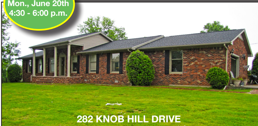
282 KNOB HILL DRIVE

OPEN HOUSE Mon., June 20th 4:30 - 6:00 p.m.