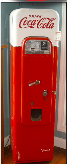
COCA COLA 5c VENDO