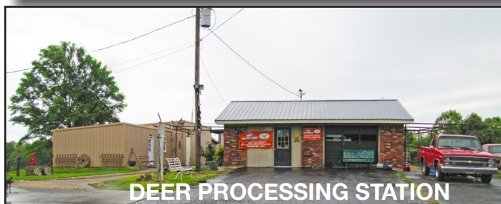
DEER PROCESSING STATION