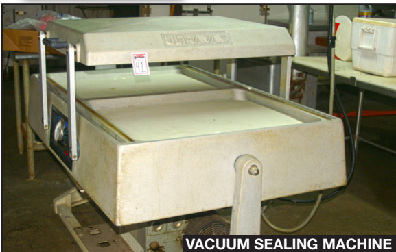
VACUUM SEALING MACHINE

Processing Equipment and Supplies: Hobart meat tenderizer; Berkel bacon slicers (2); Koch smoke maker; Hobart 4246 grinder/mixer; Hobart 4146 grinder; Ronk stuffer; Ultravac vacuum sealing machine UN 2100; Kook-Rite S-20A cooker/smokers (4); Globe band saw; meat saw; Butcher Boy meat band saw; Zubert stuffer; 12' ss bar; Frigidaire freezer (2); 1-ton Dayton winch; 1-ton long chain Dayton winch; appx. 200 totes; platform scales; spices; vacuum pack bags; casing; (10+) ss racks and ss working table.