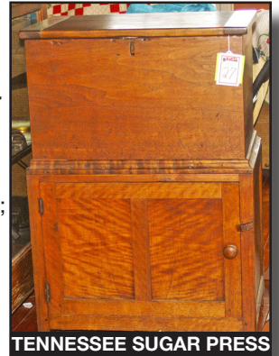
TENNESSEE SUGAR PRESS

Furniture: Kentucky cherry sugar chest ; Tennessee sugar press (Cookeville, 1840, burl walnut) ; sugar chest (Crittenden County, 1845); walnut sugar chest; Ralph Holman cherry Kentucky sugar chest; cherry linen press ; cherry Jackson press; walnut cellarette ; dry sink; "Madison Hotel" coat and hat rack; poplar top single board 8' harvest table ; corner cabinets; 1850's painted chest; 1790's Lancaster, PA Dutch dowry chest ; 5' bench; poplar bench; walnut blanket chest; hutch table; walnut dresser with marble top; cherry jelly cupboard; blanket chests; walnut bucket bench; 11.5' store counter; Woodberry "old paint" walnut corner cabinet ; Jenny Lind stagecoach trunk; walnut and mahogany Lincoln White House full bed; sidelock chest of drawers; redwash cupboard; solid "old paint" walnut bar; oak sellers cabinet; Windsor and other side chairs; mail sorter and more. Antique Firearms: J. Henry and Son "Trail of Tears" rifle; US H. Aston 1848 pistol ; Remington .45 cal 1862 Navy revolver ; British Tower flint lock pistol ; .36 cal. flintlock muzzle loader; Sharpe extra proof flint lock pistol ; Stevens .22 crackshot; Springfield .45-70; Josh Golcher rifle ; Hatfield .45 cal. cap and ball muzzleloader;