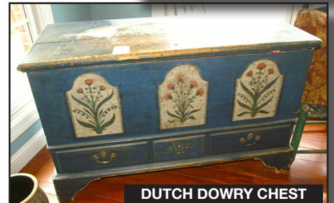
DUTCH DOWRY CHEST