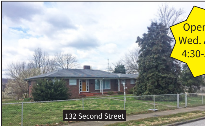
132 Second Street

Open House Wed. April 12 th 4:30-5:30 pm