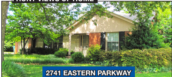
2741 EASTERN PARKWAY