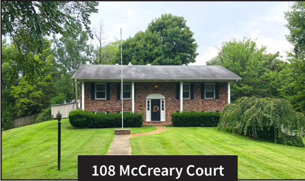
108 McCreary Court

Auction Site: 108 McCreary Court, Hartford, KY. From the intersection of Main Street (HWY 231) and Union Street go east three blocks to McCreary Court. Turn left to the property. Watch for signs!