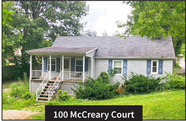
100 McCreary Court