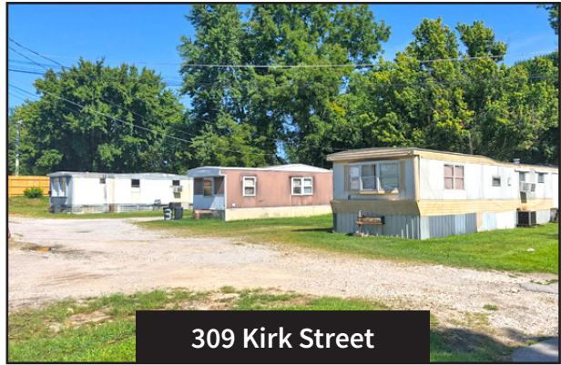
309 Kirk Street