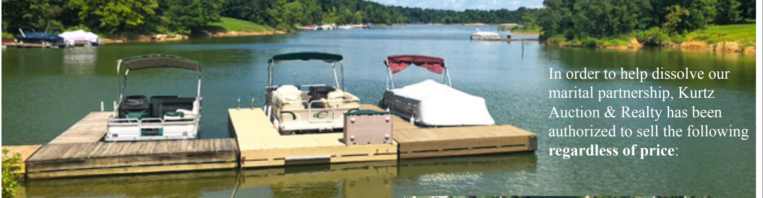
This view is of a private boat dock near the Burr Road waterfront lot.

Auction Site: 183 Shawnee Circle, Falls of Rough, KY. From the intersection of HWY 54 and HWY 631 (Concord Road), take HWY 631 2.6 miles to Duff Road, turn left on Duff Road for .2 miles then take Indian Valley Road 1.1 miles, then right on Seneca Trail to Shawnee Circle. Watch for signs!