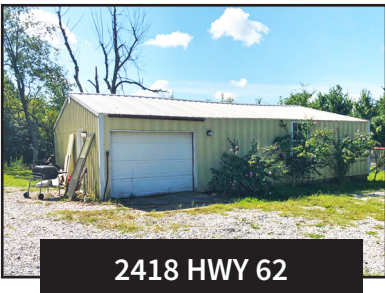
2418 HWY 62

Outdoor Living Items-Tools-Motorcycle-Golf Cart-Boat: hitch carrier; engine stand; parts washer; cornhole boards; signage; car jack; Land Rider bicycle; coolers; barrel fan; Miller Matic 210 welder; blast cabinet; pressure washer; 6' Werner ladder; drill press; transmission jack; Atlas car hoist; rolling cart; fishing poles; acetylene set; grinder; winch; folding chairs; lockers; 5500 watt generator; 60 gallon air compressor; snake machine; brush trimmer; chainsaw; wheels; tires; toolbox; Snapper mower; old truck bed; Chevrolet truck (scrap); trampoline; swing set; Club Cart golf cart; hand tools; wheel barrel; Black Max pressure washer; fishing nets; Honda 70 CRF; 1976 18' Polar Craft with 85 hp Johnson (not running); hot tub; basketball goal; set of skis (2); wake boards; security system