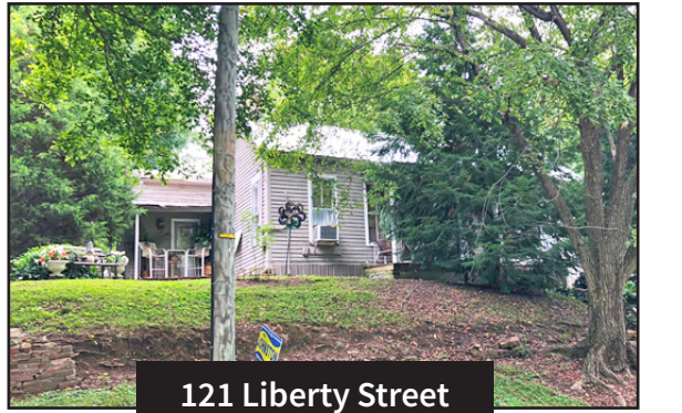
121 Liberty Street

Furniture-Household Items: Cabinet; dining table and six chairs; oak dresser; clothes rack; wardrobe; Victrola; corner entertainment center; sofa, loveseat and ottoman; recliner; Dynex flat screen TV; three piece king size bedroom suite; hutch; cupboard; book case; dishes; glassware; collectibles; Toshiba projector; Stack On total defense safe; Atlantis slot machine; Ready heaters (2); vacuum; 4-drawer filing cabinet; desk; toaster oven; crockpot; rolling cart; Bow Flex; treadmill; metal desk; Frigidaire upright freezer; Hotpoint refrigerator; Hotpoint electric range; Whirlpool washer and dryer; punching bag; Pac man game; scrapbook carrying case; Paris wall clock and misc. home décor