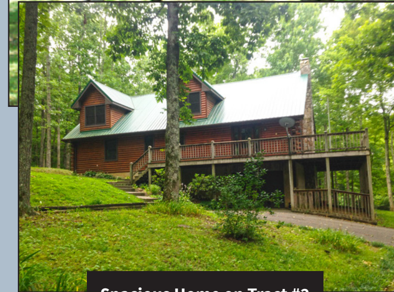
Spacious Home on Tract #2 Built New in 1992

Three- Bedroom, Two-Bath Log Home with Basement Garage and Wrap-around Decks, Plus 24' x 40' Barn on Tract #2.