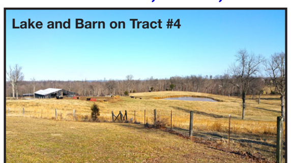
ALSO TRACTORS, COMBINE, TRUCKS, FARM MACHINERY & CATTLE

PRESORT STD U.S. POSTAGE PAID OWENSBORO, KY 42301 PERMIT #563