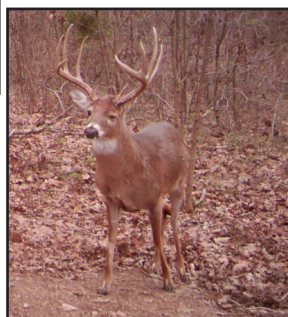
Actual trail camera photos taken on the property.