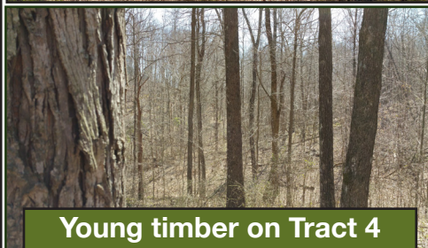
Young timber on Tract 4

Tract #7 - 1.001 Acre wooded building site with 163.3 feet of frontage.