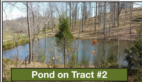
Pond on Tract #2

Tract #6 - 1.310 Acre building site that is currently cropland with 257.15 ft. of frontage.