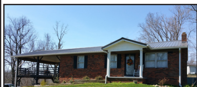
Home on Tract #1

Tract #3 - 8.551 Acres of cropland with building sites along the front and 545.38 feet of frontage.