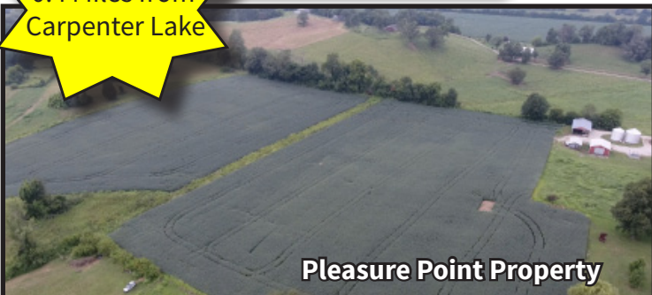
Pleasure Point Property