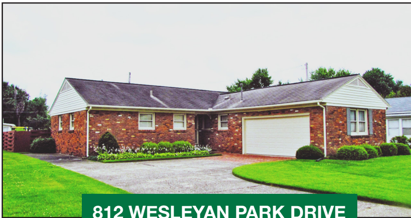
812 WESLEYAN PARK DRIVE