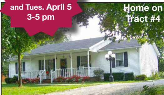
Home on Tract #4

OPEN HOUSES: Tues. March 29th and Tues. April 5 3-5 pm