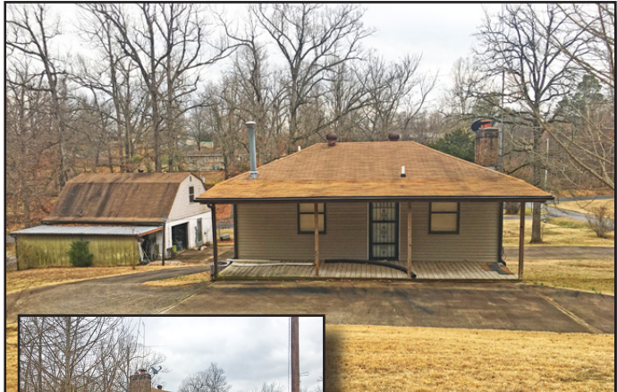
125 Hagan Drive Grand Rivers, KY